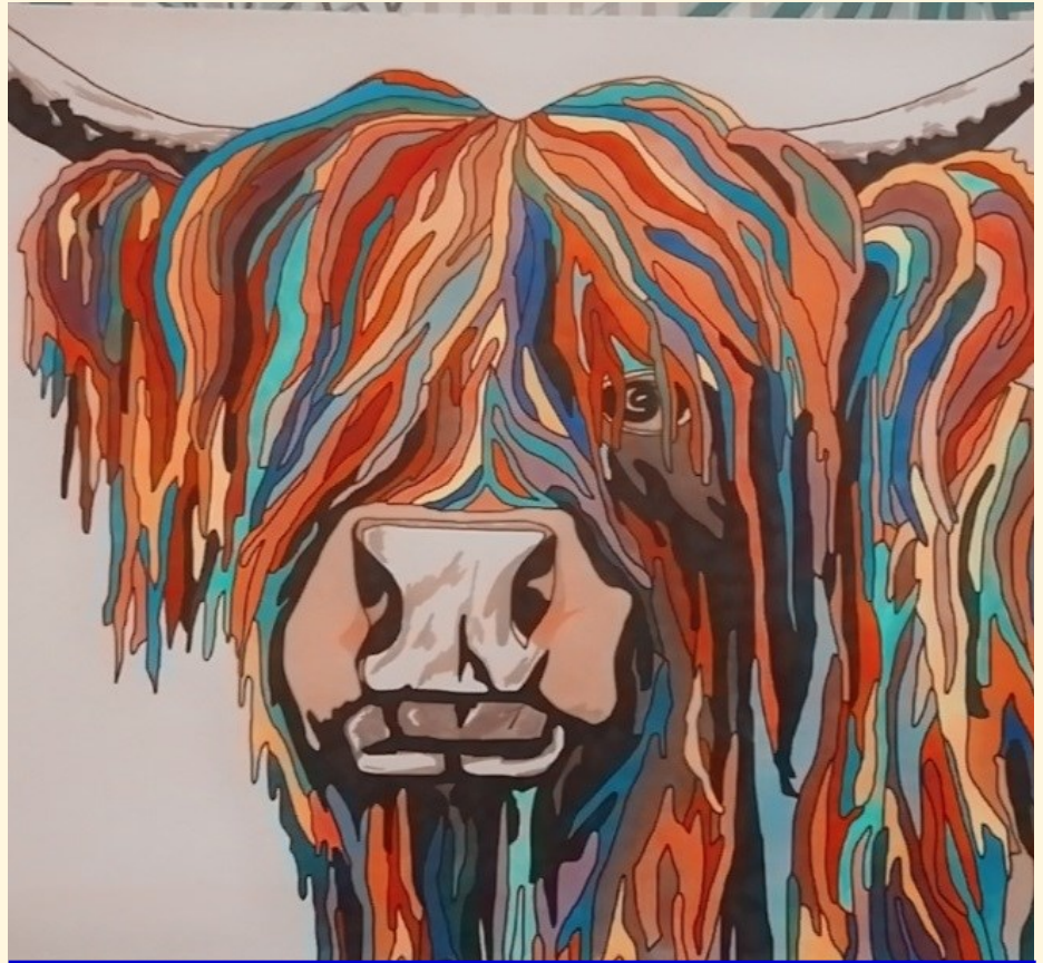
An amazing picture from Ruby Mae Hickson!