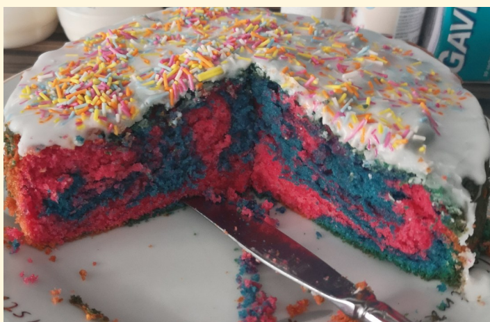
And look at this colourful and mouth watering cake from Meika in Y7—the same person who did our Manga picture. You have been busy!