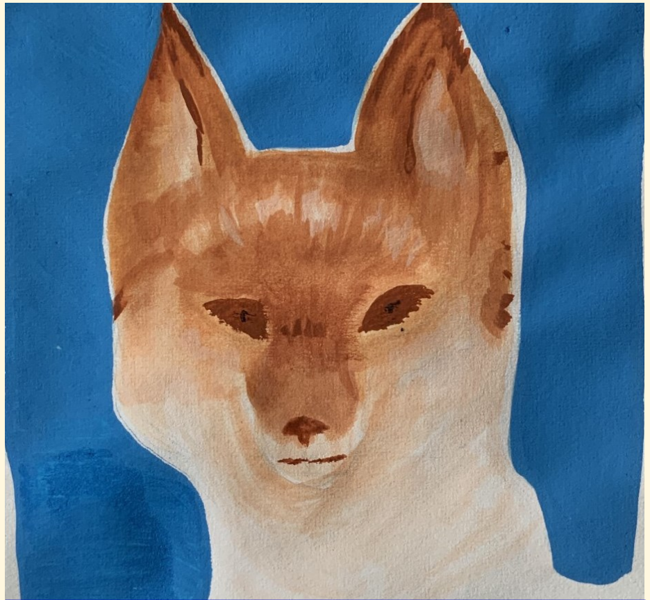
A striking picture of a fox from Alfie Lumb in Year 9—great effort Alfie!