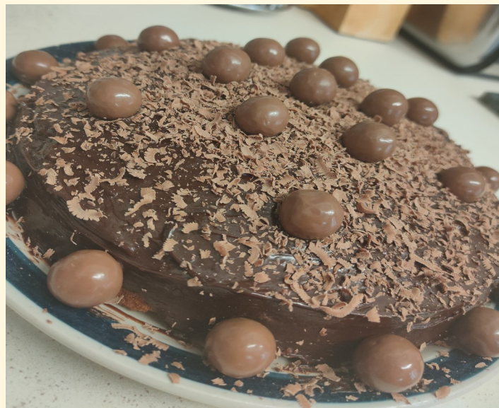
Just look at this chocolate feast from Ruby Mae Hickson. Scrumptious!